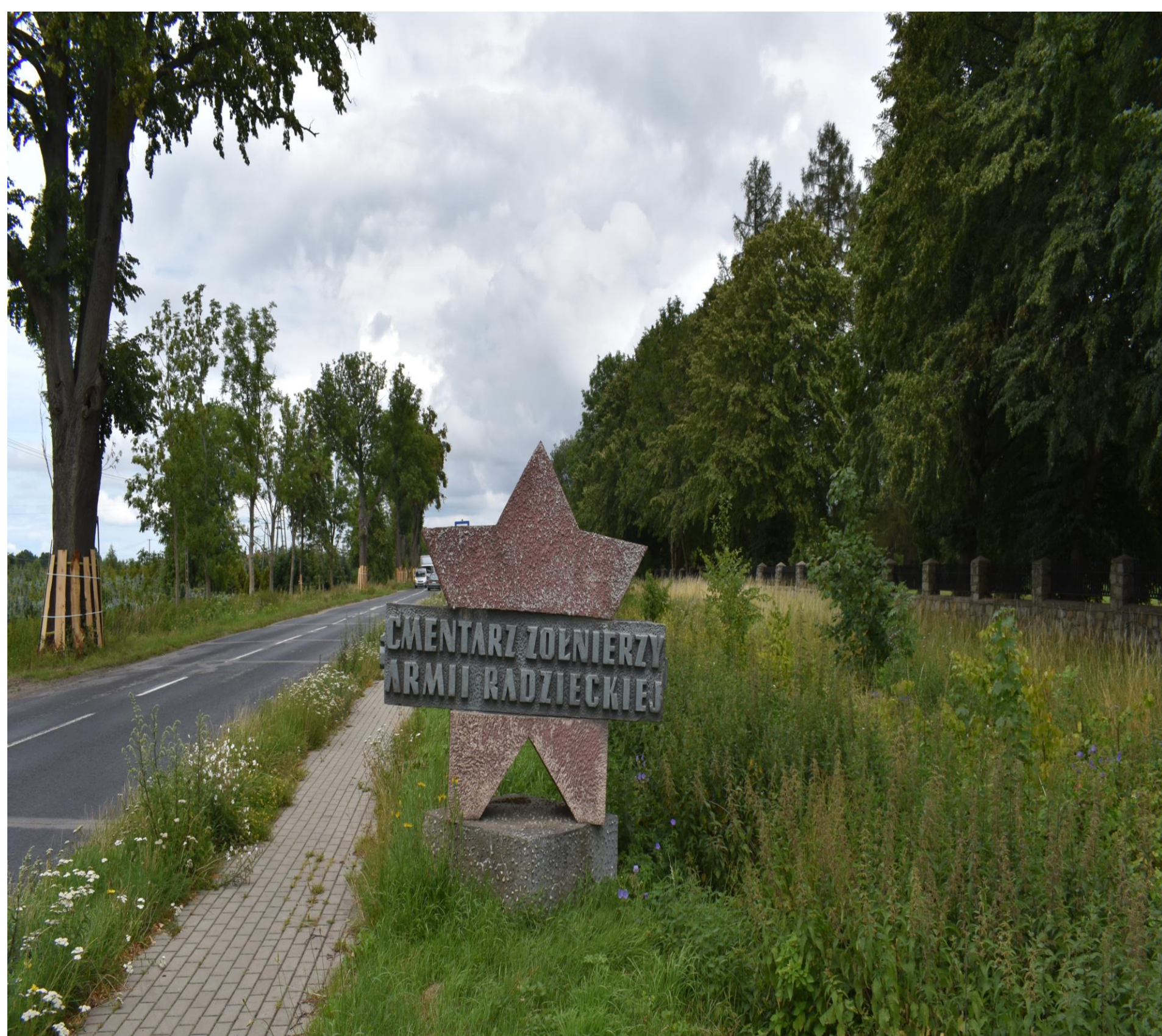
Photographs of the Soviet soldiers' military cemetery in Braniewo, (Warmia Region, Poland).