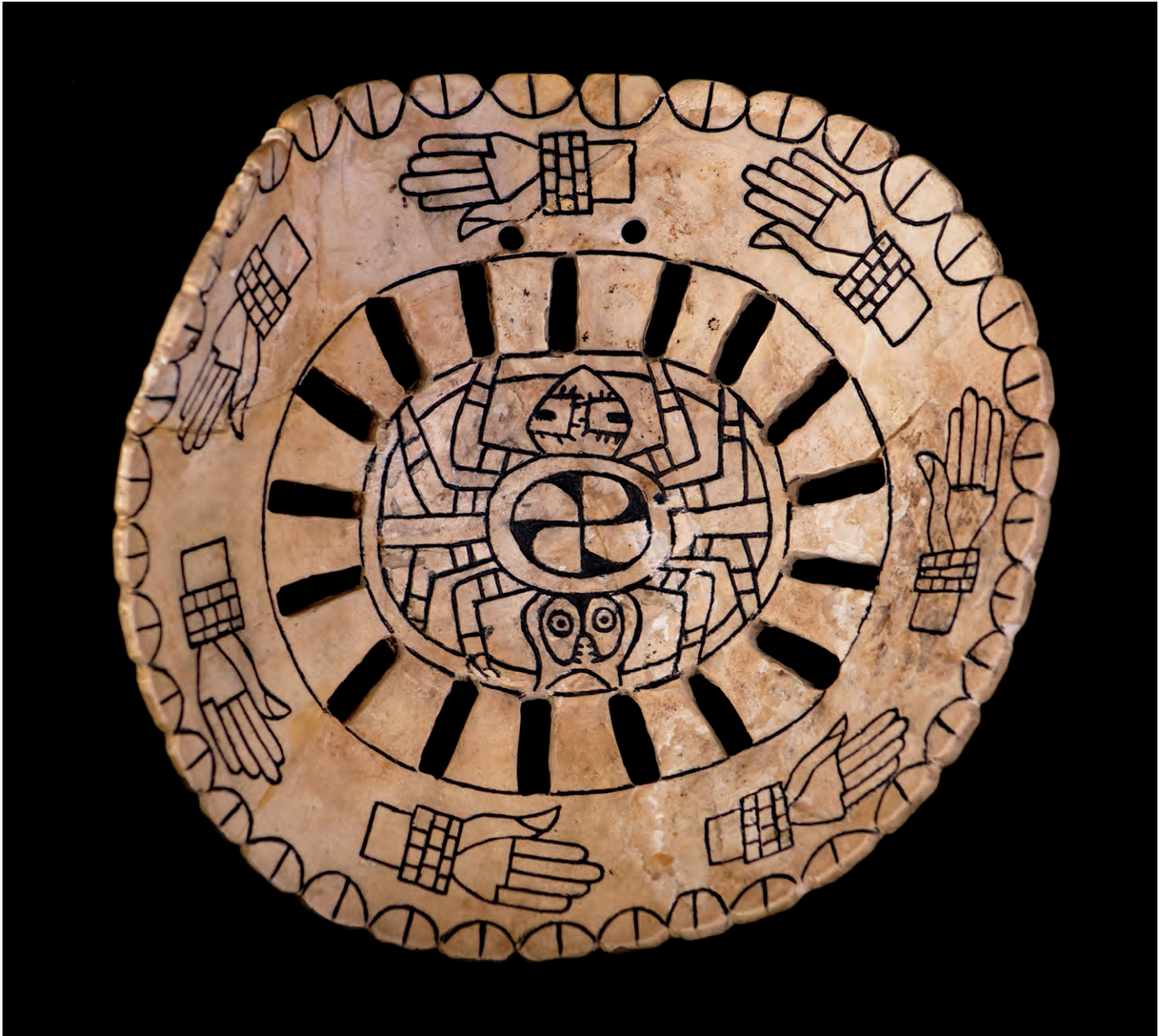
Engraved shell gorget with hands and spider. Craig style. Le Flore County, Oklahoma, Spiro site, AD 1250–1400. Marine shell.

to recapitulate pottery types such as Spiro Engraved (cup 261), Haley Engraved (cup 260), and Crockett Curvilinear Incised (cup 259). Cups also depict individual motifs, including the bilobed arrow (cups 271, 271.I, and 272A and B), arrows (cup 270), bows (cup 269), the pear-shaped appendage (cups 266–268), and the petaloid cross (cup 263).