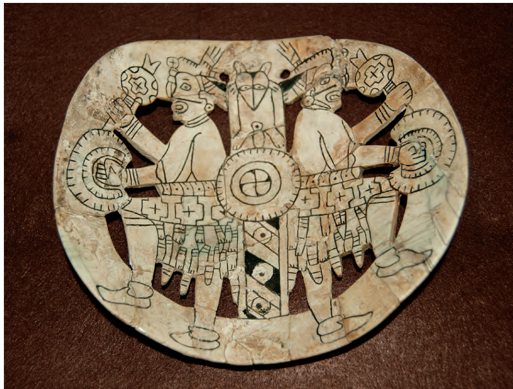
Engraved gorget with two dancing figures holding rattles and drums. Craig style. Le Flore County, Oklahoma, Spiro site, AD 1200–1450. Marine shell.

cup 286.1, where Wedgemouth occupies the right side of the cup, holding a bow as a central axial element and facing three Wedgemouth heads in vertical register on the left side. More generally, the paired figures holding bows presage Craig C gorgets 336 and 337, which depict two Wedgemouth figures and are compositionally identical. These overlapping themes are subsumed within the Hamilton and Rhoden “styles” as defined by Brain and Phillips. 7