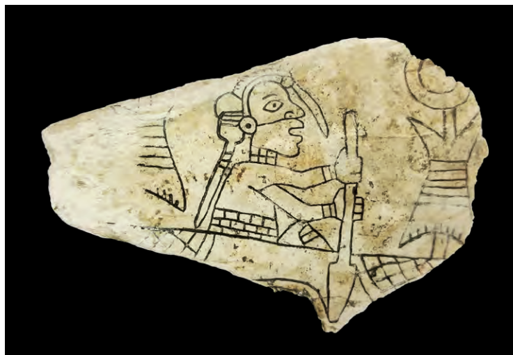
Engraved shell cup fragment of figure canoeing. Craig style. Le Flore County, Oklahoma, Spiro site, AD 1200–1450. Marine shell.

Craig A also sets the stage for later Craig subjects and themes, including T-Bar (albeit only in a single small cameo of uncertain significance), Wedgemouth, and that figure's many guises: Birdman (who remains absent from the Braden tradition at Spiro), the range of entities bearing the one-prong truncate, one-prong wavy eye surround, the serpent staff, and by extension, the forked pole (especially in treatments like gorget 141). It also provides a metaphorical basis for understanding Craig iconography, both through its depictions of powerful beings emerging through and from the rites performed by celebrants (e.g., gorgets 126, 127, 128, and 132) and—through cups like 160, which depicts canoeists bearing iconographic standards plying unnamed waters—the spread of Mississippian cosmologies and cosmogonies to the geographic margins of the Mississippian world.