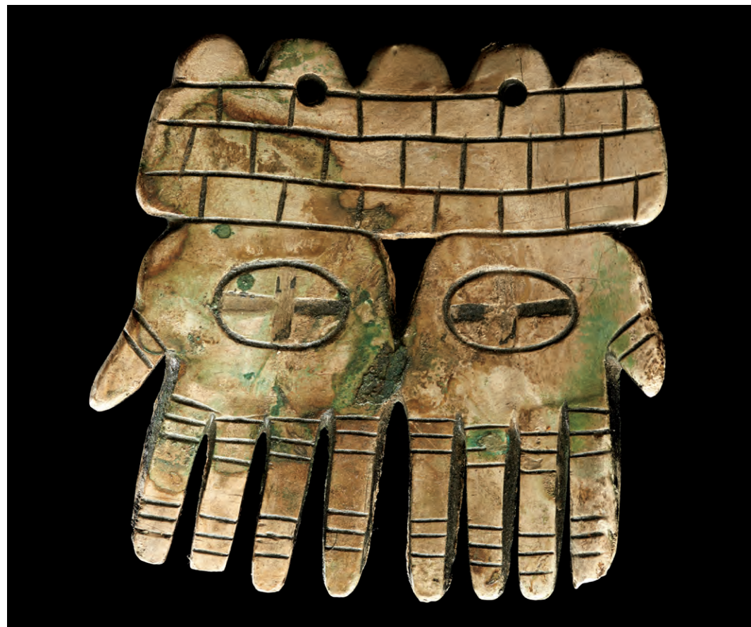
Engraved shell gorget of human hands. Craig style. Le Flore County, Oklahoma, Spiro site, AD 1250–1400. Marine shell. Gilcrease Museum, Tulsa Oklahoma.