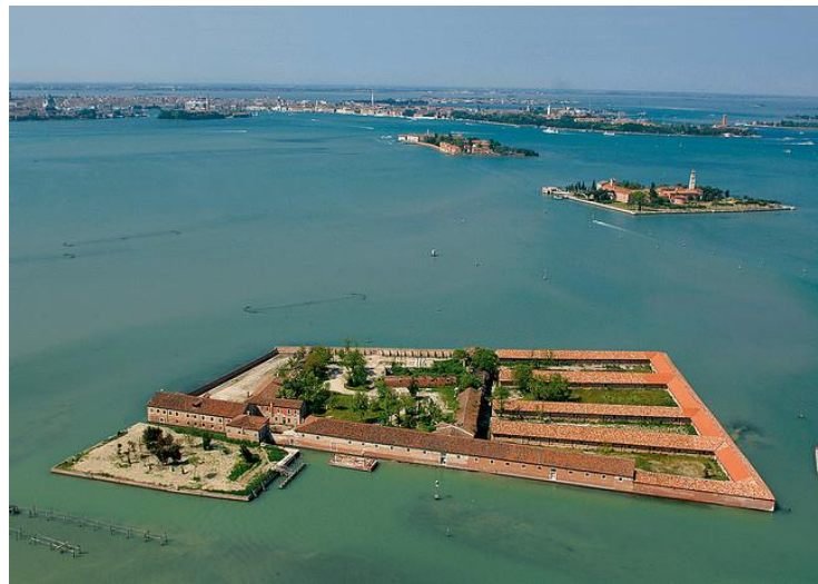
Figure 3: Aerial photo of Lazzaretto Vecchio and perimetral walls as seen today.

Recently, when studying the pest-house imaginaries in medieval and post-medieval Europe, Carmichael suggested that historians should interrogate “...plague’s spatial and temporal silences, to see something other than our traditional storied narratives, in which human actions lead to plague outcomes” (2021). Clearly, from an immunological and microbiological perspective, we should embrace a biosocial approach when understanding past and present epidemics and explore how differential spatial and temporal landscapes can lead to differential health outcomes. Roffey described that, unlike monastic medieval institutions, there was not a regular plan or predefined layout for leprosy hospitals (2012);