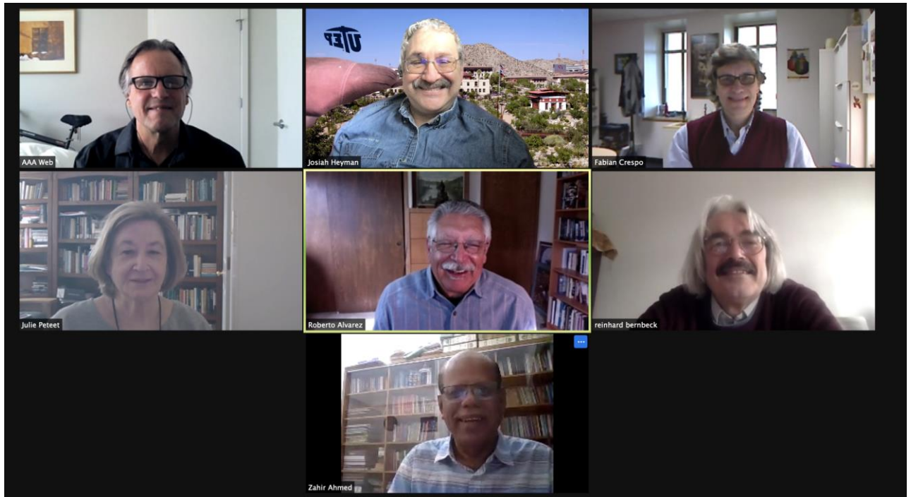
The Border Walls Task Force