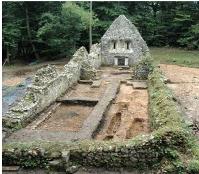
Figure 2: Archaeological site of the medieval leprosarium of Saint-Thomas d'Aizier (Haute-Normandy, France), dated from 1150 to 1550 AD.

Quarantine may be defined as the temporary restraint or segregation of people who may come into contact with transmissible pathogens (Conti 2008). As described above, the idea of isolating people that could be contagious or “impure” can be traced back to the Old Testament, where in Leviticus [13.46] it is stated that individuals with leprosy must live outside the camp. Interestingly, quarantine was implemented in different ways during human