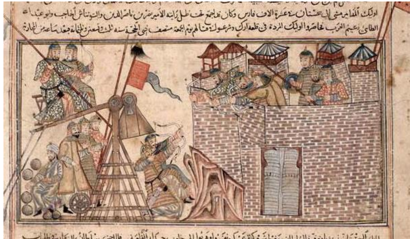
Figure 1: Mongol style siege but not the siege of Caffa (early 14th century Jami al-Tawarikh (Compendium of Chronicles) by Rashid ad-Din.

Still, we must also consider other routes or alternatives when explaining how the plague gets into Caffa, bypassing the city walls. It has been proposed